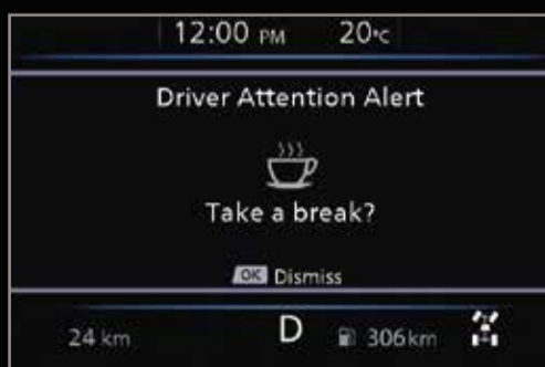
Driver Attention Alert