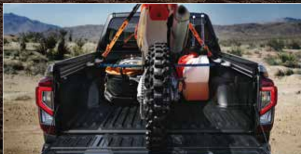
Photo shown with optional bed liner accessory.