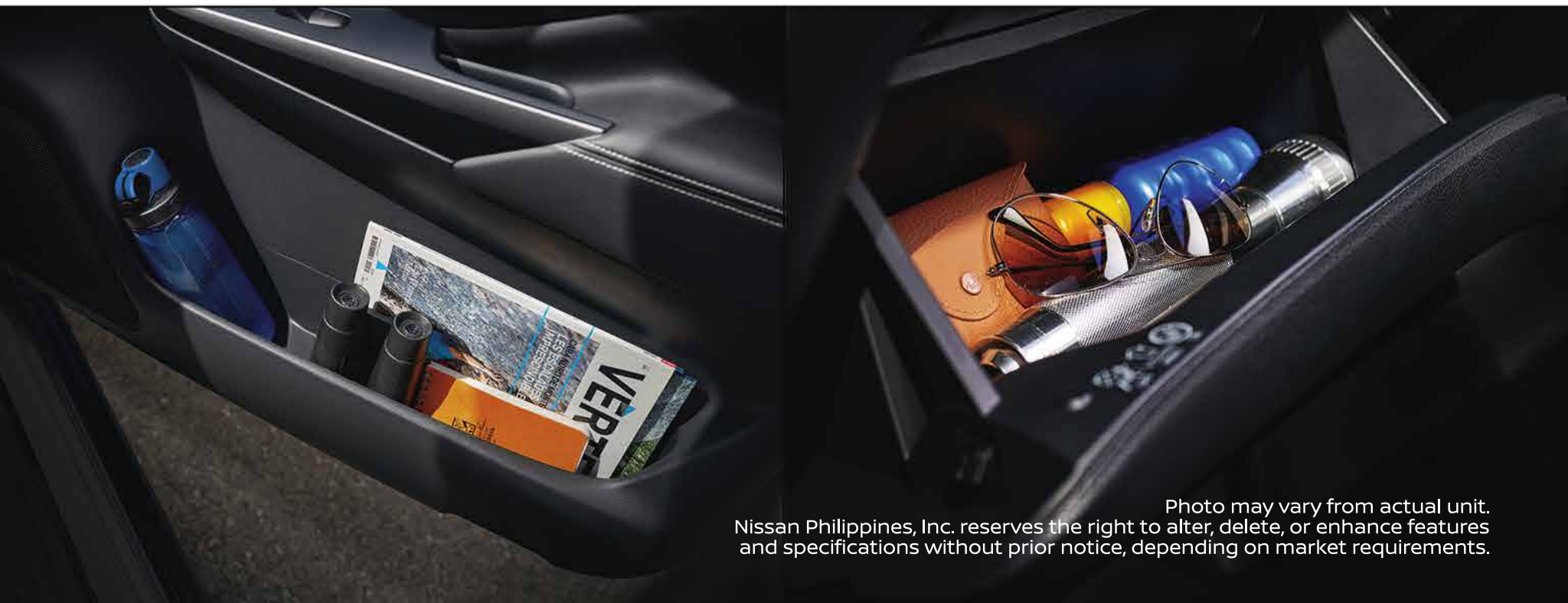
Photo may vary from actual unit. Nissan Philippines, Inc. reserves the right to alter, delete, or enhance features and specifications without prior notice, depending on market requirements.

Life can be messy, but the Navara is designed to bring order in the truck. Tuck away things with a high-capacity glove compartment, a roomy center console, and dedicated storage under the climate control. Keep your electronics charged up with accessible USB ports. You can also see Nissan's innovation in every section of the Navara. Even the cupholders are multifunctional. Perfectly shaped for your drinks, dog treats, and your gadgets.