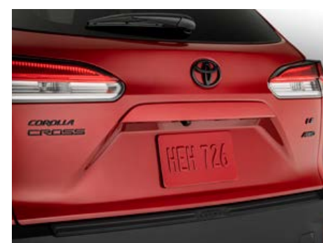
Blackout emblem overlays