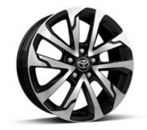
XLE 18-in. alloy wheel with black-painted machined finish<sup>4</sup>