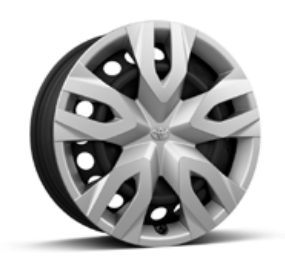
L 17-in. steel wheel with silver-colored wheel cover