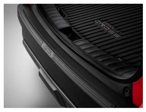
Rear bumper protector