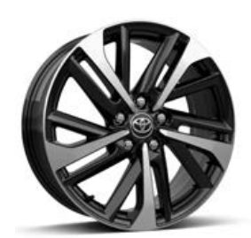
Hybrid XSE 18-in. sport alloy wheel with black-painted machined finish<sup>4</sup>