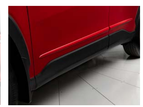
Body side molding