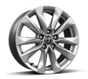
LE 17-in. silver-colored alloy wheel