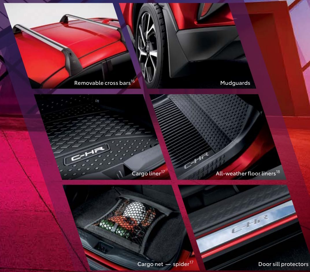
Removable cross bars 16