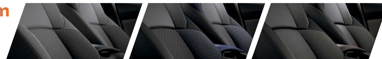
LE fabric shown in Black with Gunmetal accent