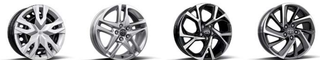
17-in. steel wheel