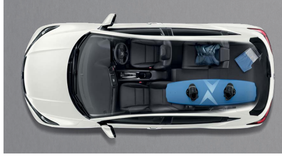
LONG MODE Front passenger seat and rear seat can be reclined to fit long items.