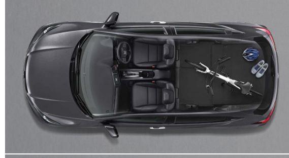
UTILITY MODE Rear seats can be lowered to free up space in the back.