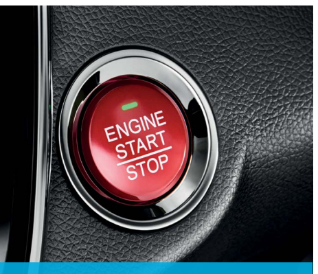
PUSH START BUTTON Ignite the engine with a simple push of a button.