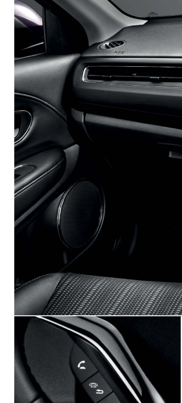
HANDS-FREE TELEPHONE STEERING SWITCH Answer or reject calls at the touch of your finger tips.