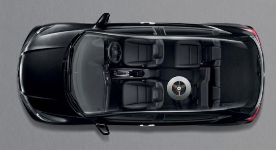
TALL MODERear seats can be folded up for plentyof floor to ceiling space.