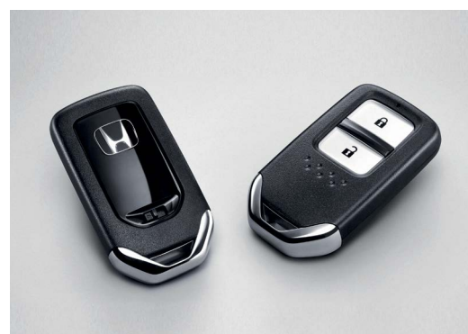
KEYLESS SMART ENTRY Lets you lock and unlock the HR-V with ease.

CONTINUOUS VARIABLE TRANSMISSION (CVT) Enjoy a smoother drive with seamless